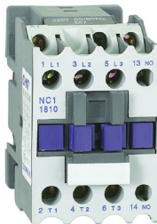
NC1 D09 10