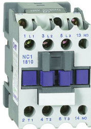
NC1 D09 01