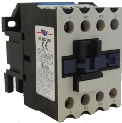
NC1 D25 08