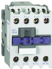
NC1 D25 01