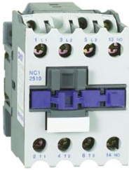
NC1 D25 10